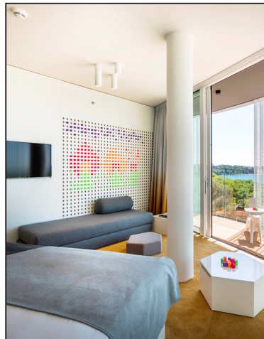
Hotel Amarin's interactive rooms

Ryanair, EasyJet, Thomson Airways and Norwegian Air fly direct to Pula, half an hour from the hotel.