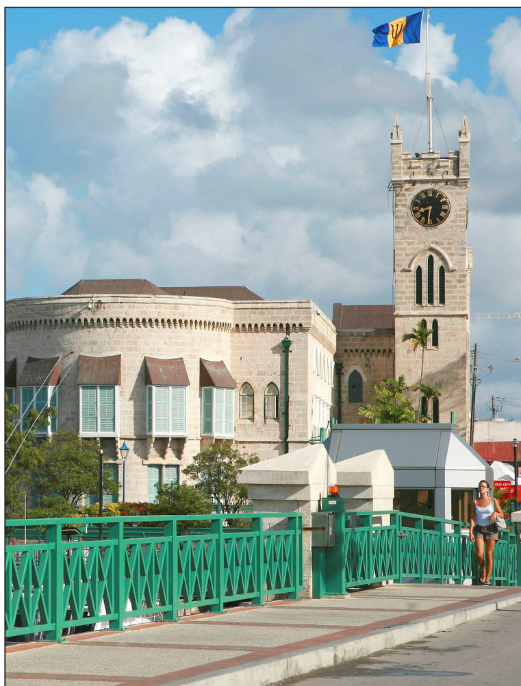
Barbados's capital Bridgetown with its pretty coloured buildings

There's just enough time for a quick walk around the museum too, which tells the story of how the Jews came to be in Barbados, fleeing to the Caribbean island in the 17th century from former Dutch Brazil after being driven