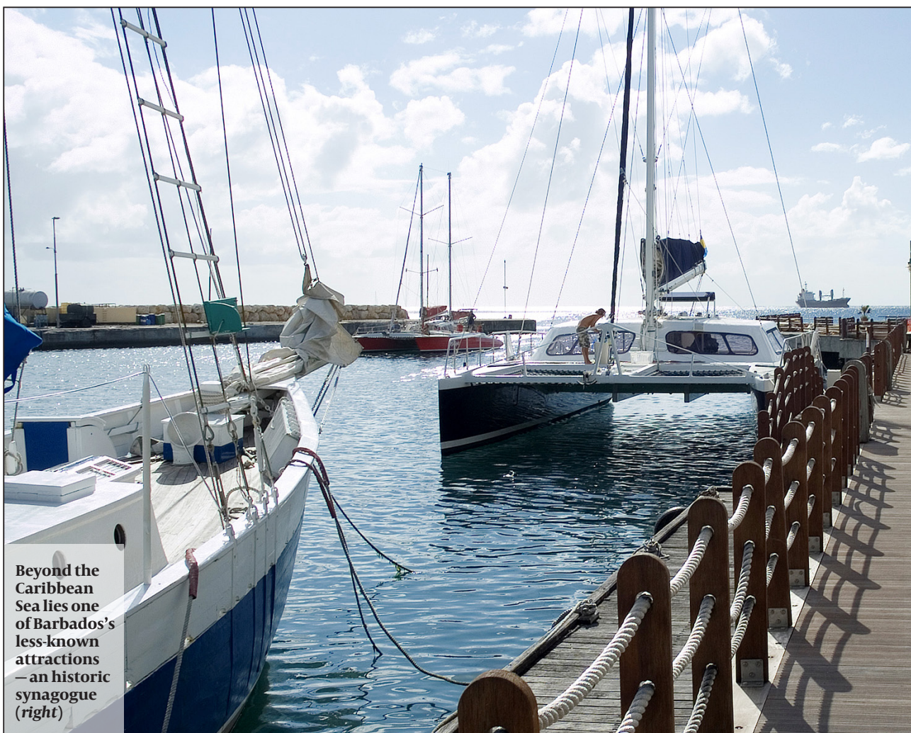
Beyond the Caribbean Sea lies one of Barbados's less-known attractions—an historic synagogue (right)

Though services do not run throughout the year, and mainly take place during busy tourist seasons, there is, perhaps unbelievably, another synagogue too, Shaare Tzedek. Two Jews, three synagogues, as the old joke goes.